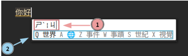
Fig. 1. fcitx , an input method editor, with fcitx-rime input method engine and zhuyin input method

backend, which runs in user space, runs a server that receives sequences of key events from the frontend and translates them into CJK characters by calling APIs from an input method engine.